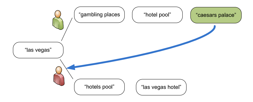
Fig. 1. Illustration of the Search Shortcuts method

Figure 3 illustrates how the search shortcuts are utilized for query recommendation. Here, a previous user whose final query was "caesars palace" had a successful session; that is, the user clicked on at least one of the results returned by the search engine for the final query. We can therefore reduce search/refinement duration of a new user by suggesting the final query from the previous successful session with identical queries. As shown in the figure, rather than allowing the user to refine the initial query to "hotels pool" and "las vegas hotel", "caesars palace" is more likely to direct the user to a landing page with more relevant results thereby creating another successful session.